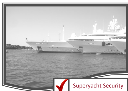
✓ Superyacht Security

Our bespoke Close Protection course includes both Enhanced Surveillance Module & Hostile Environment training as part of the syllabus, a must for the modern day Close Protection Operator.