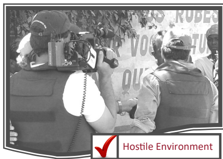
✓ Hostile Environment