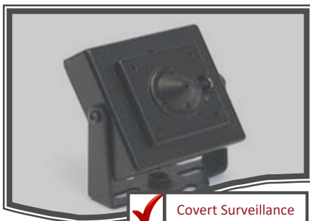
✓ Covert Surveillance